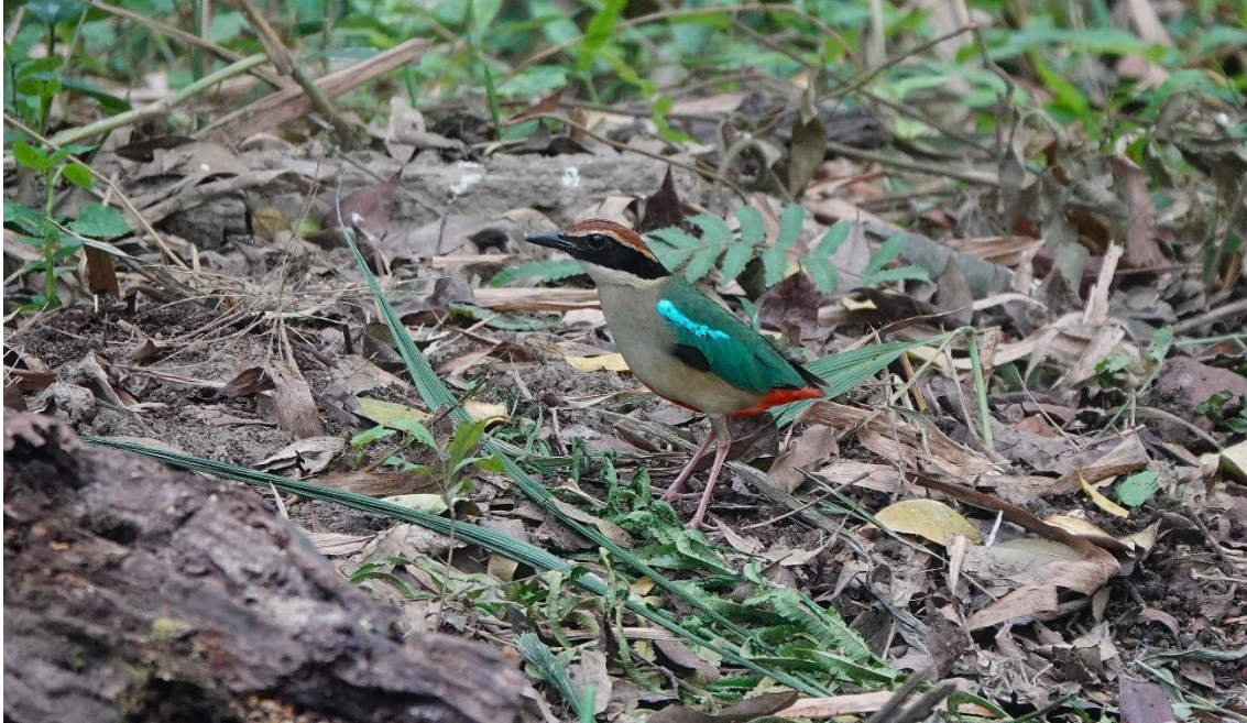
The stunning Fairy Pitta will be a big target during our final days in Taiwan

May 3, Day 14: Douliou to Taipei. This morning, we will likely continue birding around Douliou with our local guide looking for Fairy Pitta. Depending on which targets we have yet to see, we will then head north and visit some more coastal sites en route to Taipei focusing on finding the uncommon Chinese Egret or any other remaining targets.