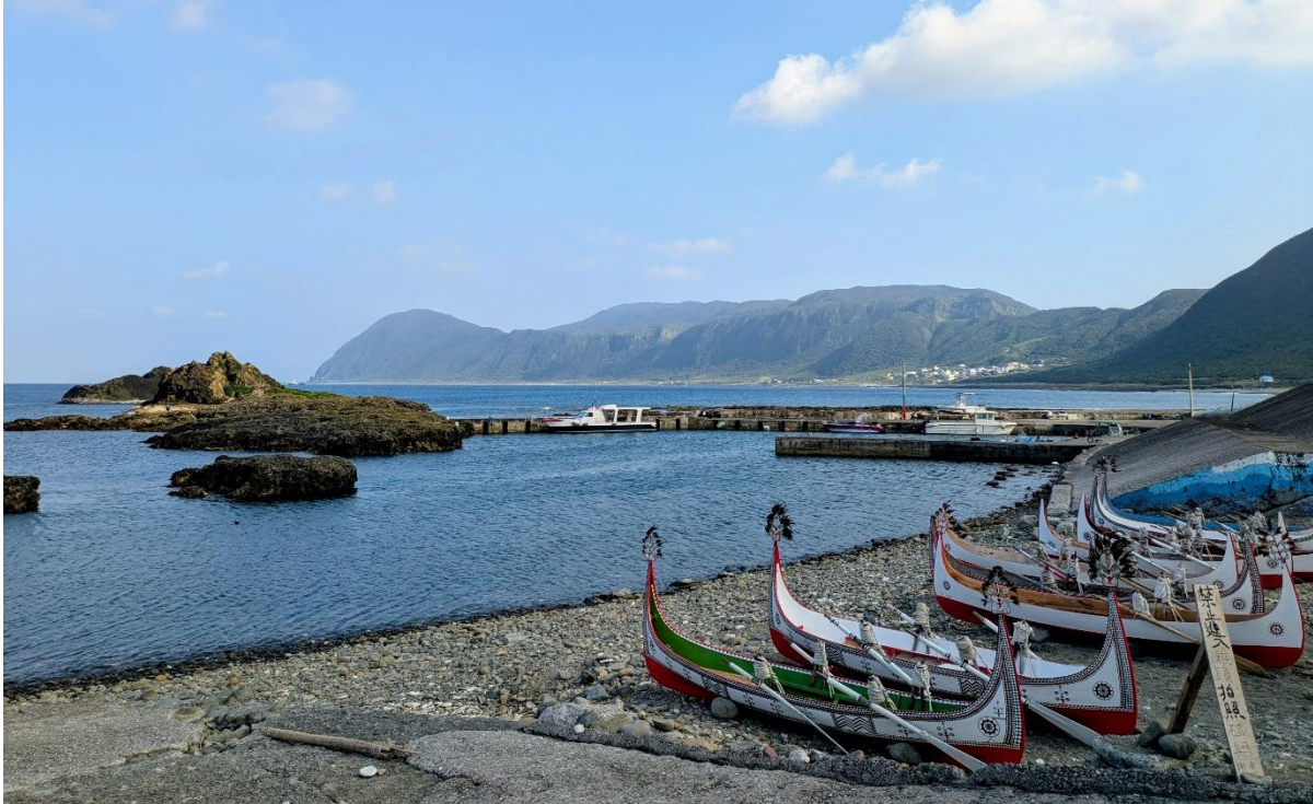
Traditional fishing boats line parts of the shore on the tranquil Lanyu Island

April 27, Day 8: Hengchun to Lanyu Island. Today we will cross from Hengchun to Lanyu Island by ferry. Lanyu Island has a tropical climate, and its geography and ecology are considered more closely related to the Philippines than Taiwan. There are many species of plants and animals not found on Taiwan, and some are endemic to the island. The Yami aboriginal people still live on Lanyu Island and rely on farming and resources provided by the ocean for their living. Flying fish are the main target for the local fishermen, and we will likely see some ourselves gliding above the water during the crossing. The distinctive traditional fishing boats make a striking first impression on visitors to Lanyu. The crossing is typically pleasant, and there is a chance at a few seabirds including Wedge-tailed Shearwater, Streaked Shearwater, Bulwer's Petrel, and Red-tailed Tropicbird.