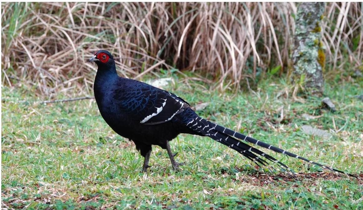
Mikado Pheasant is only found at high altitudes on Taiwan

April 22, Day 3: Taipei to Dasyueshan. Before moving on from Taipei, we will make an early morning visit to the Taipei Botanical Garden in order to beat the crowds. Our first birds may include Light-vented Bulbul, Asian Glossy Starling, Swinhoe's White-eyes, the strange Malayan Night-Heron, and the noisy Taiwan Barbet. All are regularly encountered here.