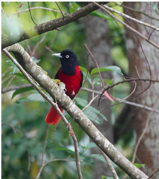
The beautiful "Crimson" endemic race of Maroon Oriole

NIGHT: Forestry Bureau Lodge, Dasyueshan