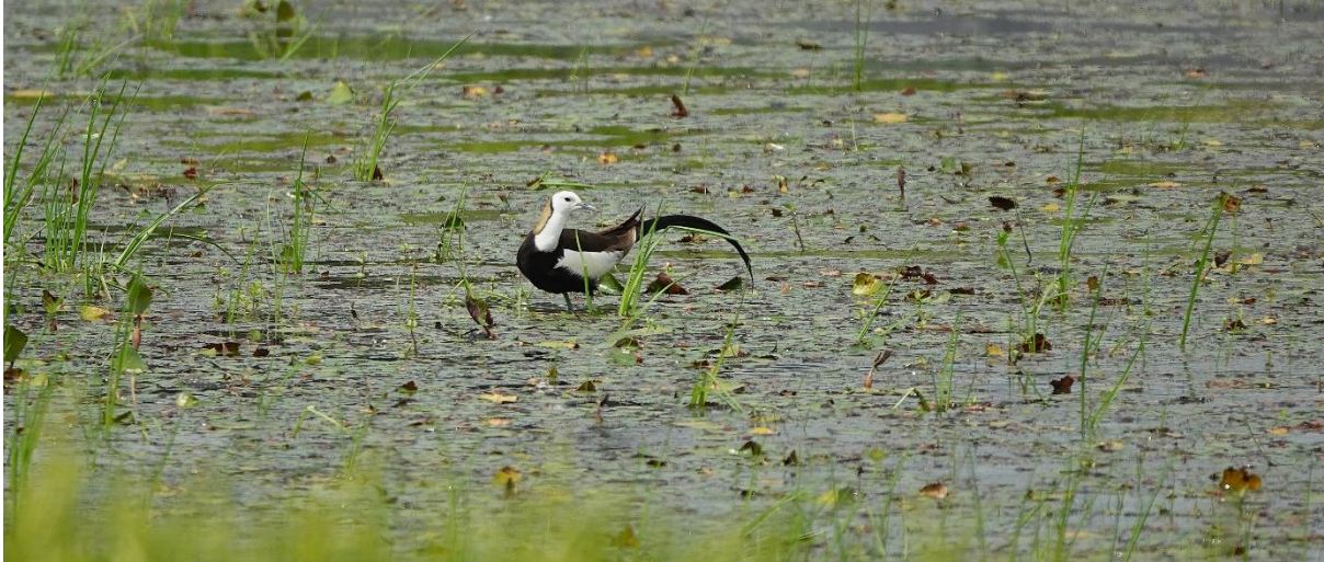
The wonderful Pheasant-tailed Jacana is highly localized in Taiwan

April 29, Day 10: Hengchun to Chiayi. Today we will head north towards Taiwan's eastern coast. Around Chiayi we will visit two wetland areas of international importance, Aogu and Budai, in search of migrating waders among others. Today will also be our best chance to find the endangered Black-faced Spoonbill and a slim possibility of picking up a critically endangered Spoon-billed Sandpiper amongst the large flocks of East Asian waders. On the expansive mudflats, we may also find hundreds of Kentish Plovers, Dunlin, Siberian Sand-Plovers, Red-necked Stints, Common Greenshanks, Black-bellied Plovers, Pacific Golden Plovers, and Purple Herons. In the fishponds by the roadside, we will stop to check out the incredible numbers of Eurasian Black-winged Stilts and hundreds of plovers and peeps. We might pick out Black-tailed Godwit, Long-toed Stint, Spotted Redshanks, and even the scarce Ruff. As we search through the shorebirds, Whiskered Terns and Black-headed Gulls will be actively flying around us.