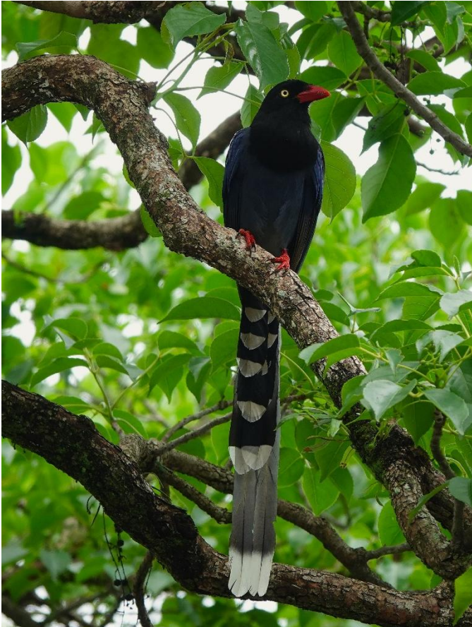
The striking Taiwan Blue-Magpie

May 1, Day 12: Alishan. This morning, we will head uphill to Tataka, the summit area of Alishan, and reacquaint ourselves with some of Taiwan's higher altitude birds. This eastern section of Alishan is home to East Asia's highest peak, Yushan, at 13,113 feet. The Mikado Pheasant is often easier here than at Dasyueshan. Walking along the Tataka Trail can be very exciting with possibilities including endemics such as Taiwan Barwing, Collared Bush-Robin, Taiwan Bush Warbler and Taiwan Fulvetta.